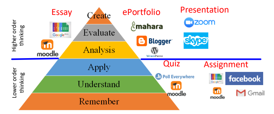
Figure 1. The method for assessment online and digital tool

online course assessment are online literature search, essay, quiz, case study and presentation. Depending on the level of awareness and objectives of the subject, the teacher will design an appropriate assessment method. In this study, a method assessment for higher order thinking and lower order thinking is proposed as shown in Figure 1